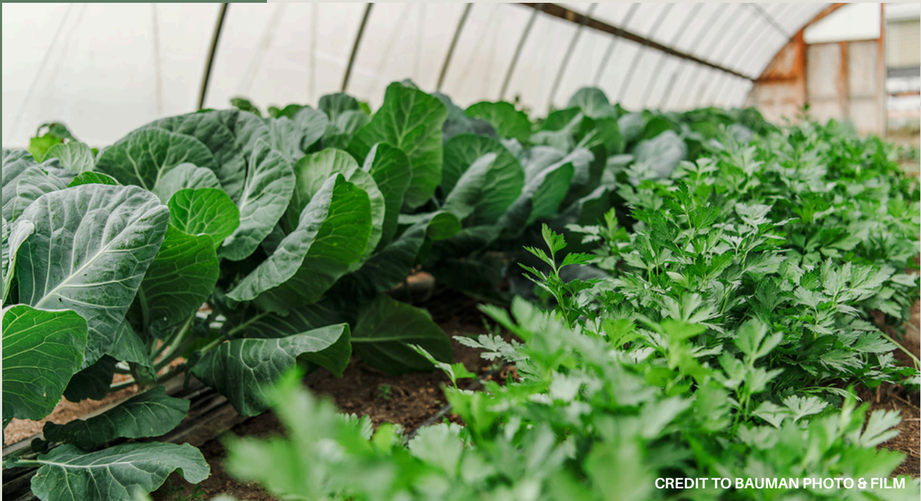
Your Growing Impact: Veggie Baskets Delivered 2020-2025